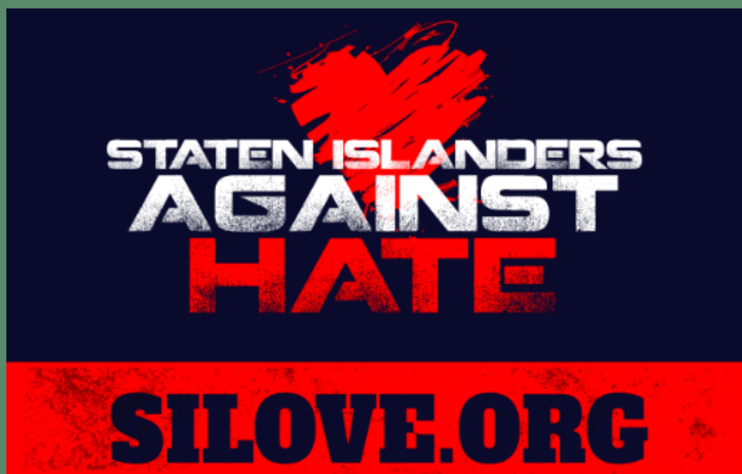
STATEN ISLAND HATE CRIMES TASK FORCE